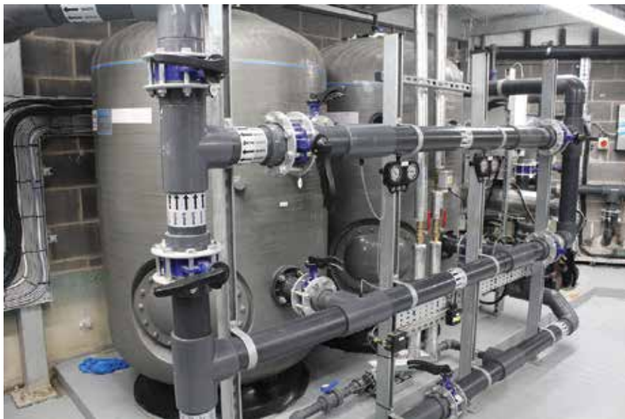
The SMDD range of Micron commercial filters were chosen because of their unique fishtail lateral arrangement.

The pumps chosen were the high-quality Waterco Hydrostar and Hydrostorm commercial pumps, which are specifically designed to meet the demands of the commercial market in regard to performance, reliability and quietness.