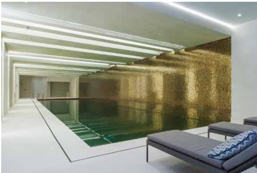
The Health and Fitness Suite at London Docks is billed as a place where you can get in shape or soothe away the stresses of the day.