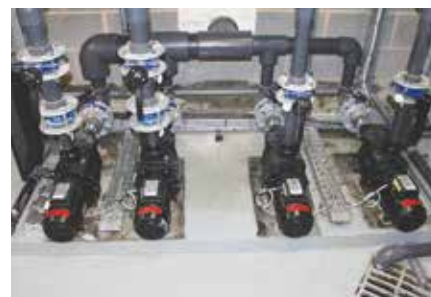
Waterco Hydrostar and Hydrostorm commercial pumps, which are specifically designed to meet the demands of the commercial market in regard to performance, reliability and quietness.

www.waterco.com www.aquaplatinumprojects.co.uk www.paramountpools.co.uk