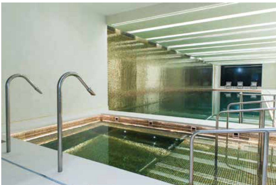
The pool features a vitality spa located at one end comprising of a number of spa jets and two stainless steel neck massagers.

Neighbouring world-famous landmarks including Tower Bridge, the Tower of London and the River Thames, London Dock is a mixed-use “destination” development containing luxury apartments and penthouses, beautifully landscaped open spaces, water gardens, central squares and boulevards lined with shops, bars and restaurants.