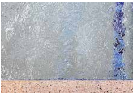
"The ozone that's coming into the pool produces tiny bubbles, and the kids are fascinated with the texture of the water and how soft it makes their skin feel,"