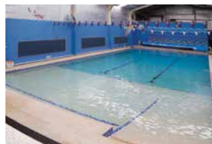
The pool caters for the "very young, easily distracted, and special needs" customers. It includes a shallow area for toddlers and fearful learners to experience the fun and safety issues.