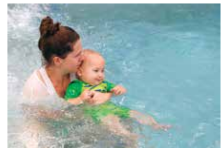
"One of the joys I get from my work is seeing the mums, dads and grandparents spending one-on-one time with their young children and grandchildren"