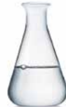
Perox ( H_2O_2 ) is a specially formulated blend of hydrogen peroxide – which is simply water with an extra oxygen molecule – that has been developed to work in unison with the Hydroxypure system to ensure perfectly sanitised water at all times.

"I am now teaching the children of the children I once taught – that's two generations of swimmers in the one family," she explains. "One of the joys I get from my work is seeing the mums, dads and grandparents spending one-on-one time with their young children and grandchildren, without worrying about the daily duties that come with parenting. Seeing their smiles is why I wake up every morning."