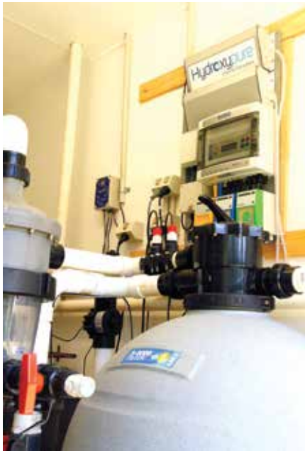
The Hydroxypure system continually sanitises your swimming pool by testing the water and automatically maintaining optimum levels of residual sanitiser.

"The most pleasing aspect of this installation has been the multiple problems that Hydroxypure has solved for the owners at this site," says its inventor Nick Briscoe. "These problems are common within most swim schools. Many operators are not aware that there is an alternative to chlorine now that is proving that they no longer must be subjected to an uncomfortable environment to work within an industry that they are passionate about."