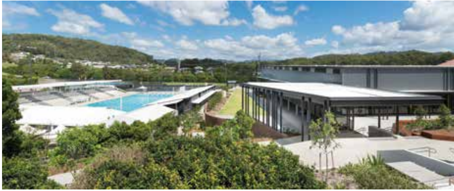
There are two Somerset College swimming pools now sanitised by Oxi Swim: a 50,000-litre infant pool and 100,000-litre learn-to-swim pool.