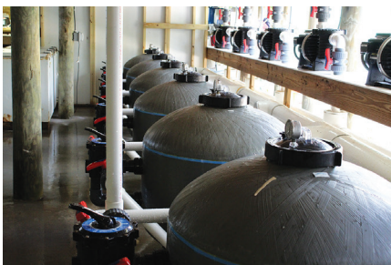
Waterco's Micron Commercial Fibreglass Filters are made from continuous strands of high quality fibreglass filament wound under controlled tension to create a seamless, impervious vessel.