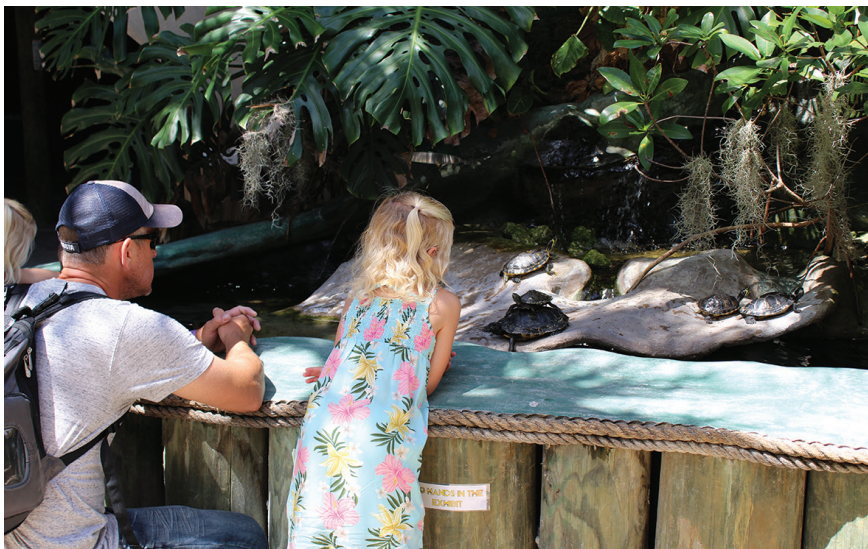
Florida Keys Aquarium Encounters lets the public get a closer look at (and feel of) its diverse collection of aquatic animals.

Unlike traditional aquariums that separate visitors and animals between panels of glass, Florida Keys Aquarium Encounters lets the public get a closer look at (and feel of) its diverse collection of fish, stingrays, and sharks, and even invites visitors into many of the tanks.