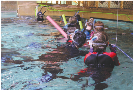
40-plus people per day swim and interact with species including sharks, Caribbean stingrays, and fish.